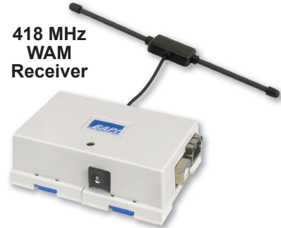
418 MHz WAM Receiver

The Wireless Asset Monitor (WAM) unit receives data from all BAPI wireless 418 MHz sensor/transmitters. The receiver delivers the data simultaneously to the Universal Serial Bus (USB) output for local use and to the RJ45 Ethernet port for communication with a BAPI WAM Website (see "Associated Products" below) or to a web address of your choice.